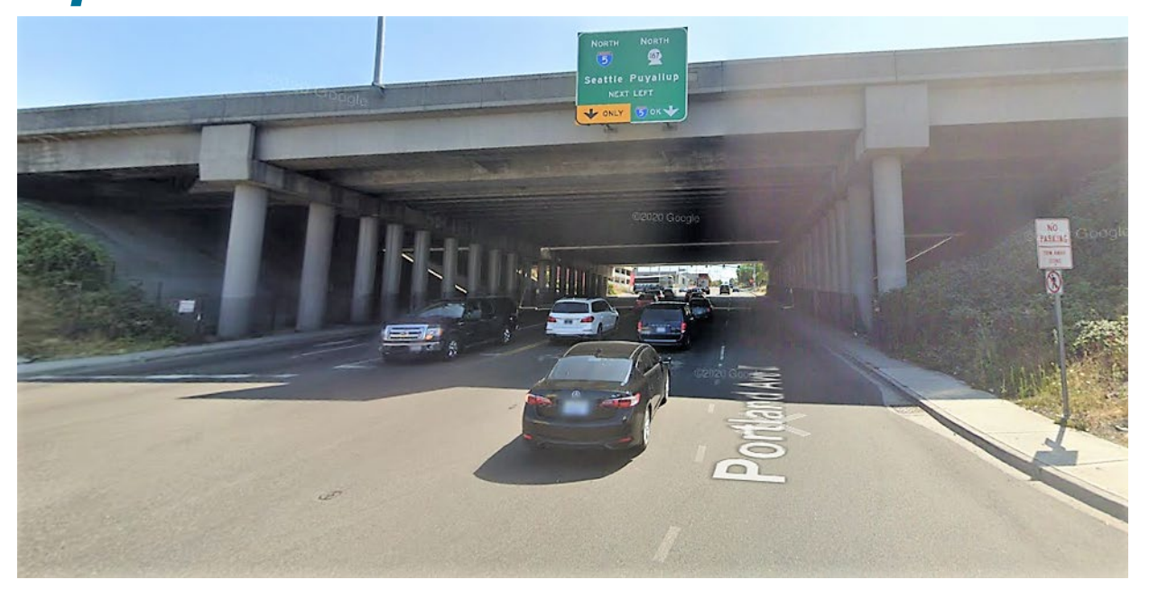
Portland Ave looking south